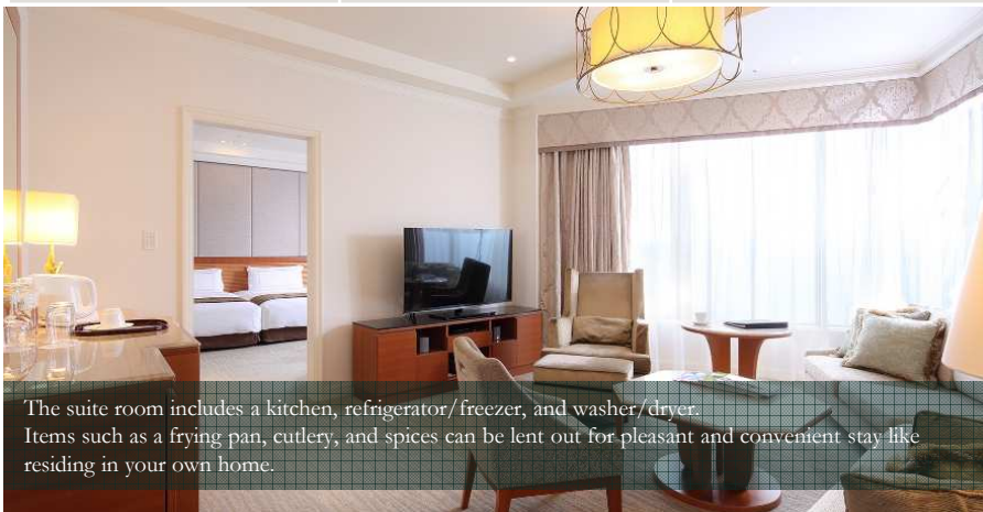
The suite room includes a kitchen, refrigerator/freezer, and washer/dryer. Items such as a frying pan, cutlery, and spices can be lent out for pleasant and convenient stay-like residing in your own home.