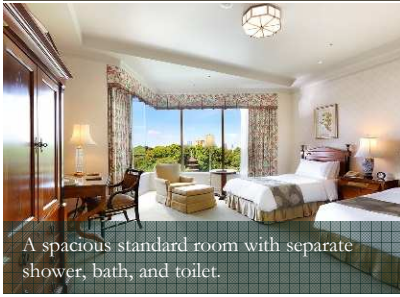
A spacious standard room with separate shower, bath, and toilet.