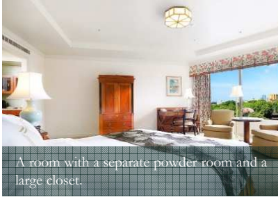
A room with a separate powder room and a large closet.