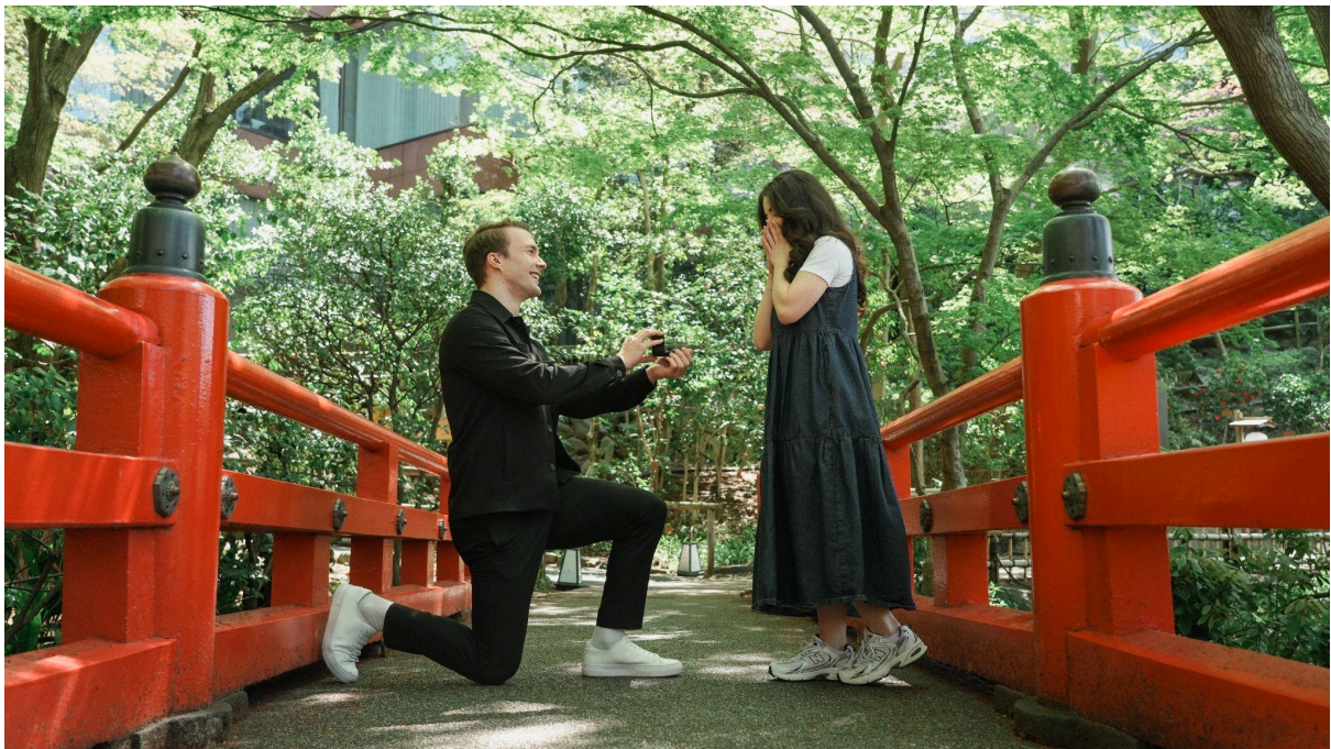
Photo of a couple proposing in Chinzanso Garden

In response to growing demand, Hotel Chinzanso Tokyo announces a photography plan for proposals with an English-speaking photographer in Chinzanso Garden.