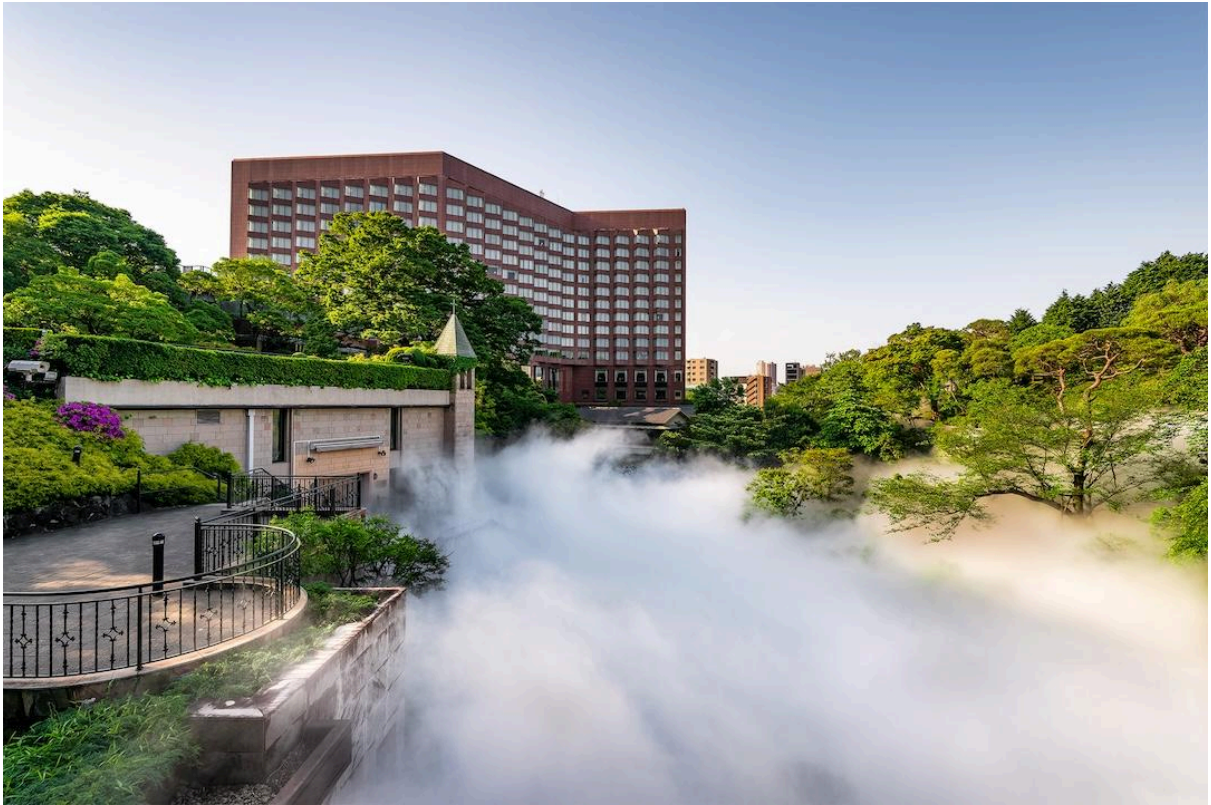
The Tokyo Sea of Clouds at Hotel Chinzanso Tokyo