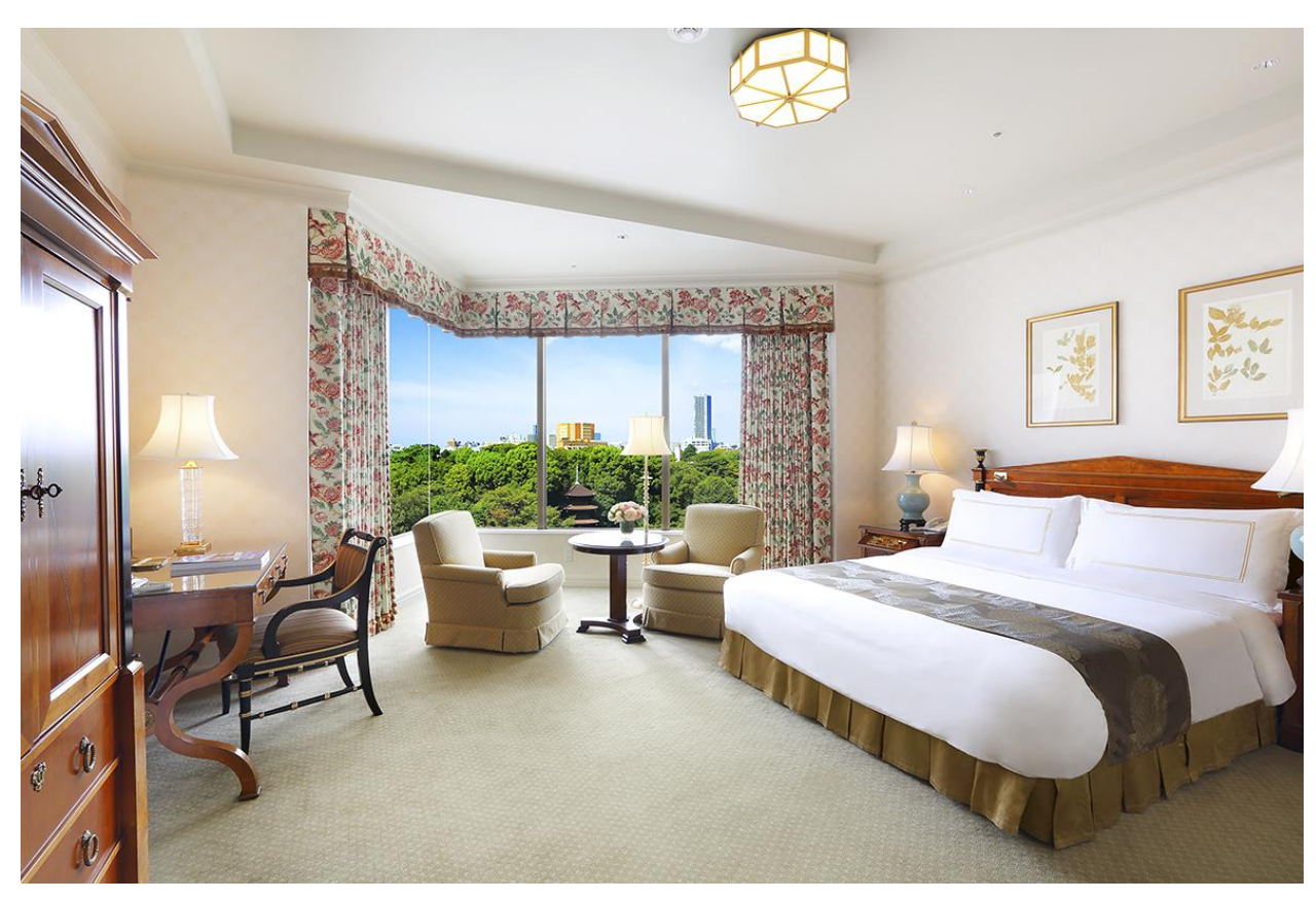
The Prime Superior room at Hotel Chinzanso Tokyo