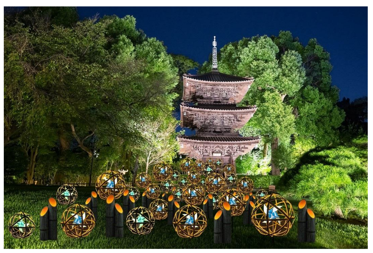
The Suzukaze Takeakari at Hotel Chinzanso Tokyo

Experience a refreshing summer retreat with glowing lanterns, a cool breeze, and traditional Japanese artistry.